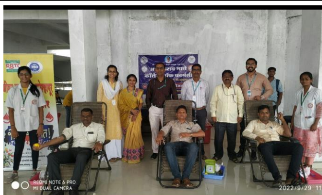
Blood donation at AMCP Peth vadgaon on the occasion of World Pharmacist Day